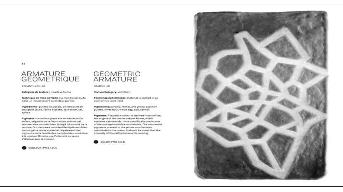
Fig. 3 Spread design by Bob Beck.

raised by the book's cover and the ambiguity of the exhibition photos. At the same time, new questions surface about the implications of the designer's work.