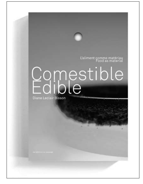
Fig. 1 Cover design by Bob Beck.

The English subtitle of Diane Leclair Bisson's new bilingual publication, Comestible/Edible, is "Food as material." On first consideration, the subtitle is strikingly banal, a minor modification to an equally underwhelming title. Isn't food, somewhat by definition, both edible and material? The rest of the cover's cues, however, start to reveal the innovative nature of this book, and what it actually represents begins to emerge. The French title, and its use of comestible and matériau, layers in the notions of food as non-eatable, not as mere ingredient, but as substance, as construction matter. The curious thirteen-millimeter bore, piercing the front and back covers and the 120 pages between, raises more questions: marketing angle? editorial metaphor? third eye? The arty cover photo is presumably food,